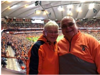
SU / Louisville game in the Dome